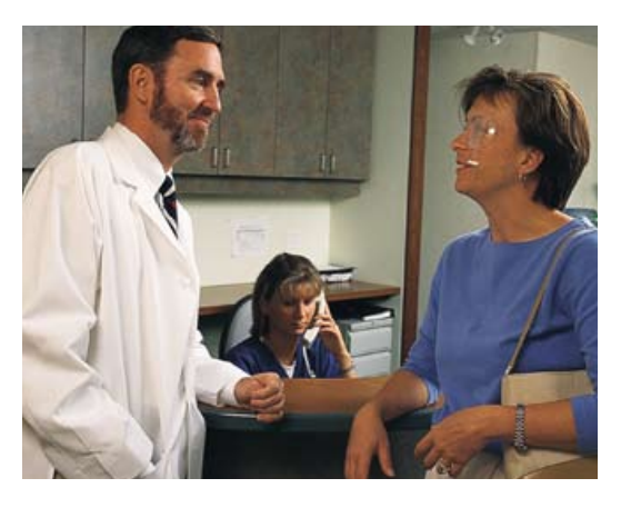
An eye shield worn after LASIK

You should arrange to have someone take you home after the surgery. Taking a nap or simply relaxing for the rest of the day is recommended. Usually your vision will be clear enough to drive to the follow-up visit the next day. The doctor may advise waiting several days before you resume a normal work schedule. The doctor should advise you on how long you should wait before resuming sports, exercise, or strenuous activity.